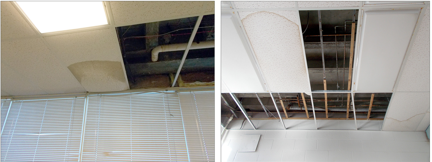
Figure 7: Damaged or Removed Classroom Ceiling Tiles Due to Leaks in Recently-Installed Roofs