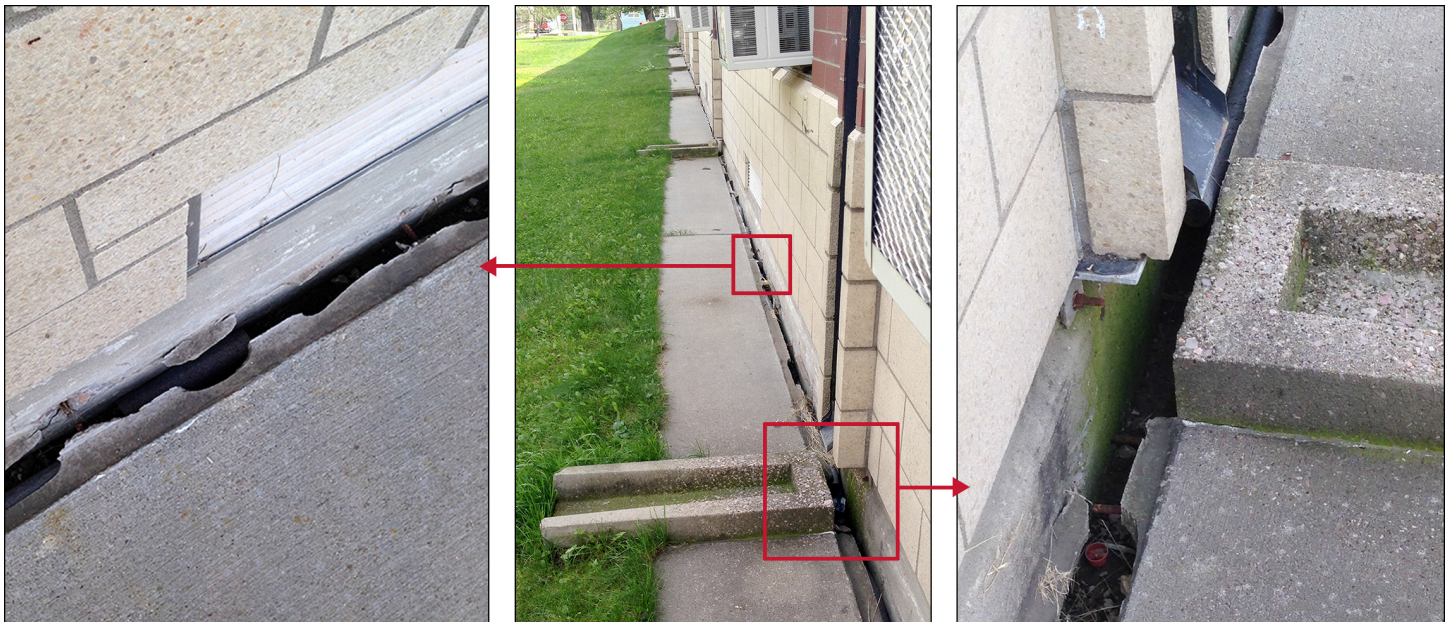
Figure 4: Building Damage Caused by Poorly Maintained Rainspouts at BIE-Operated School

GAO-15-389T