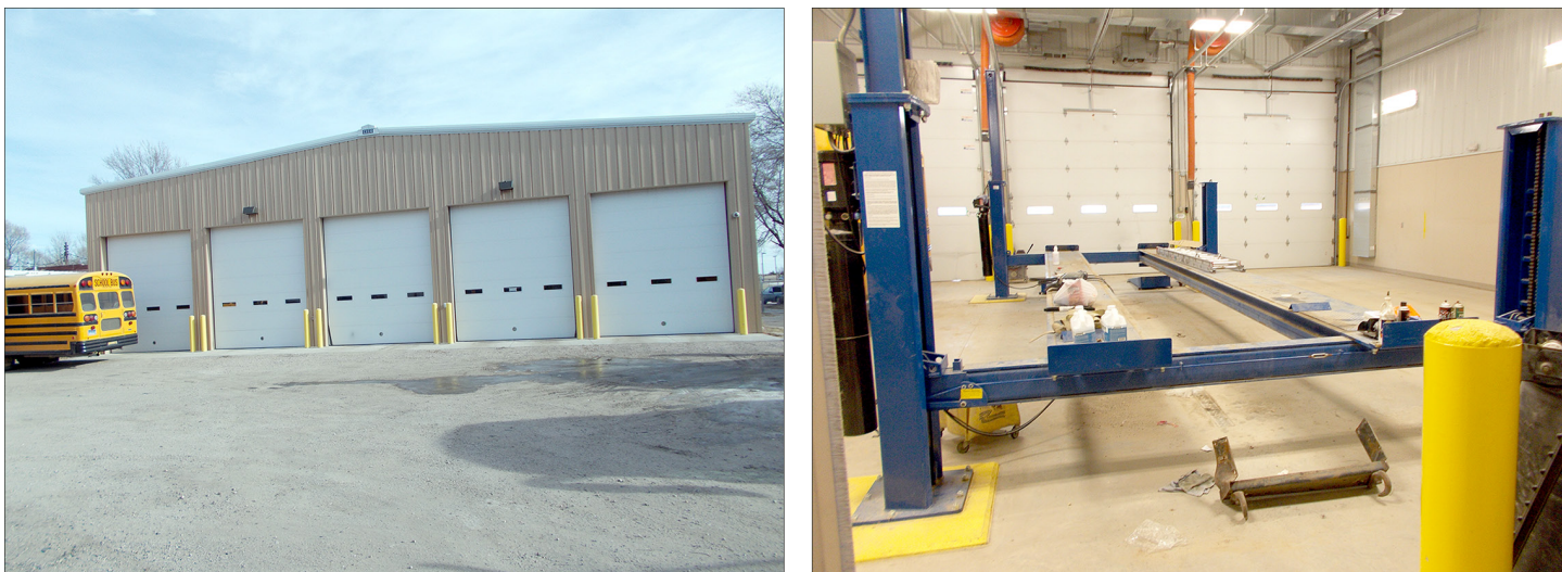
Figure 8: Exterior and Interior of Recently-Constructed Bus Maintenance Building Where Door Does Not Close When a Large School Bus Is On Hydraulic Lift