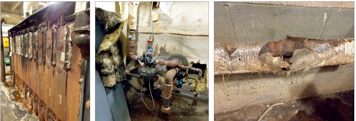
Figure 2: Aging Boiler Systems at a BIE-Operated School Built in 1959

Several schools we visited during our ongoing review faced challenges with aging facilities and related systems. For example, at one school built in 1959 we observed extensive cracks in concrete block walls and supports, which a local BIA agency official said resulted from soft marsh soil and a shifting foundation. According to school officials, two of their boilers are old, unreliable, and costly to maintain, and sometimes it is necessary to close the school when they fail to provide enough heat. According to school officials, these systems also reflect 1950s technology, so the costs to maintain them are high. Staff told us they also have difficulty acquiring parts for these systems and, in some cases, fabricate work-around parts to replace outmoded parts that wear out or break. School and regional BIA officials considered the boilers to be safe, but a BIE school safety specialist reported that the conditions of the school's boilers were a major health and safety concern. (See fig.2.)