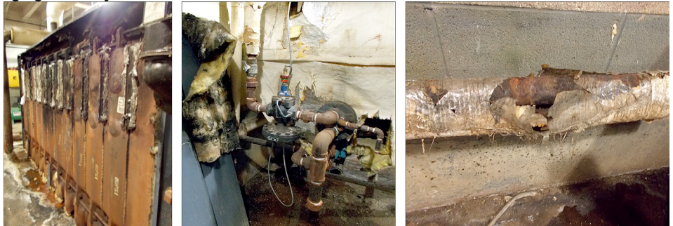
Aging Boiler Systems at a Bureau of Indian Education School Built in 1959

Information on the physical condition of Bureau of Education (BIE) schools is not complete or accurate as a result of longstanding issues with the quality of data collected by the Department of the Interior's (Interior) Office of the Assistant Secretary-Indian Affairs (Indian Affairs). GAO's preliminary results indicate that issues with the quality of data on school conditions—such as inconsistent data entry by schools and inadequate quality controls—make determining the number of schools in poor condition difficult. These issues impede Indian Affairs' ability to effectively track and address school facility problems. While national information is limited, GAO's ongoing work has found that BIE schools in three states faced a variety of facility-related challenges, including problems with the quality of new construction, limited funding, remote locations, and aging buildings and infrastructure (see figure below).