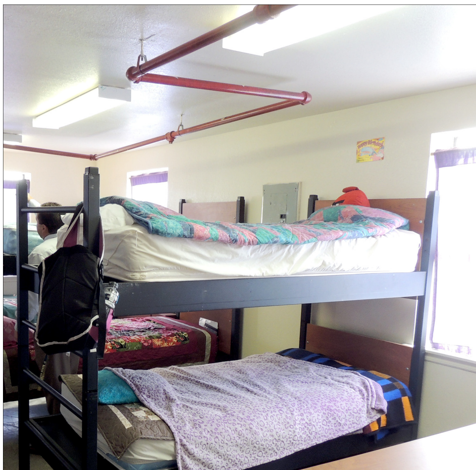
Figure 3: Bedroom in an Elementary Student Dormitory Built in 1941 at a BIE-Operated School

At another school, we observed a dormitory for elementary school students built in 1941 with cramped conditions, no space for desks, poor ventilation, and inadequate clearance between top bunks and sprinkler pipes in sleeping areas. School officials noted that students had received head injuries from bumping their heads on the pipes and some students had attempted suicide by hanging from them. (See fig. 3.)