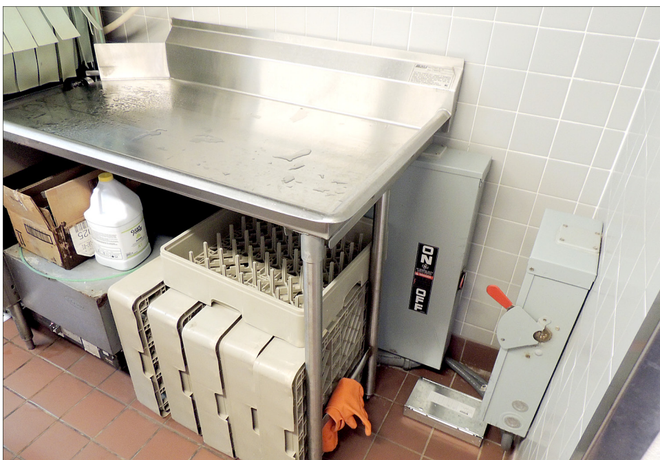
Figure 6: High Voltage Electrical Panel Installed Next to Cafeteria Dishwasher at a BIE-Operated School, October 2014